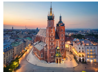
St. Mary's Basilica, Krakow