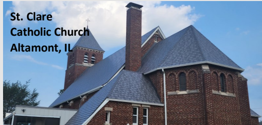
St. Clare Catholic Church Altamont, IL

Our manufacturer, Isaiah Industries, founded in 1980, is based in Piqua, Ohio, and we share a common life philosophy of Faith, Family, and Service.