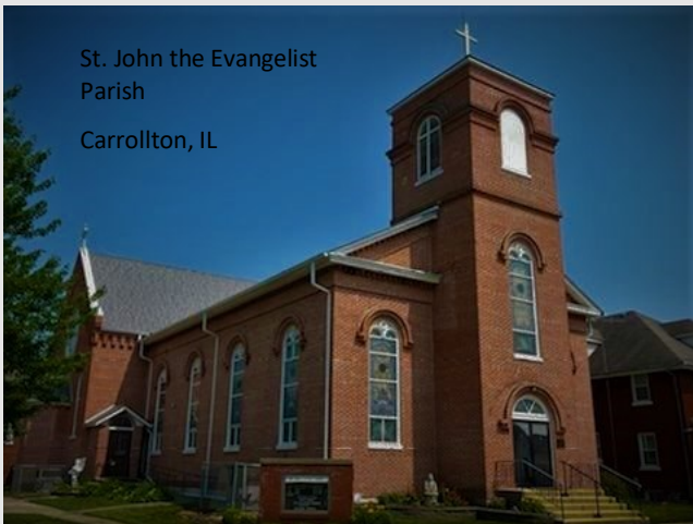
St. John the Evangelist Parish Carrollton, IL